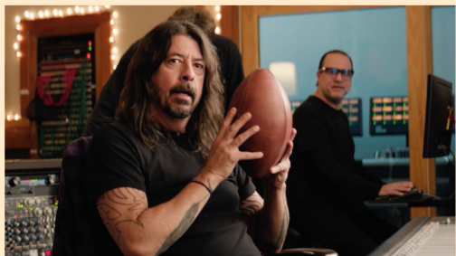
Crown Royal Super Bowl LVII 'Thank You Canada' Sound Design & Mix

Check Out >>> Latest Work / Food+Bev / Fashion+Beauty / Lifestyle+Tech / Sports / Car / Original Music