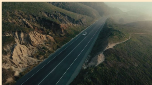
Lexus 'RZ O5OD' Sound Design & Mix