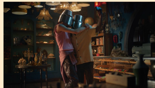
Hinge 'Designed to be Deleted' Original Composition

Request a Custom Reel >>> alex@otbirds.com